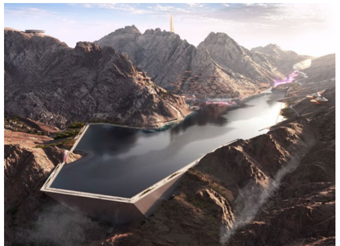
Trojena, NEOM (render)