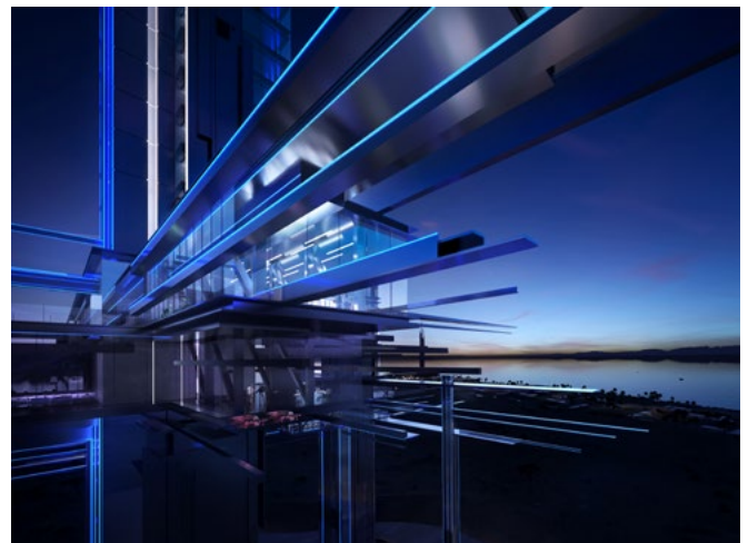
Epicon Hotel, NEOM (render)