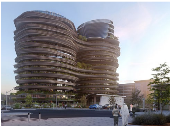
SIRO Olaya Riyadh (render)