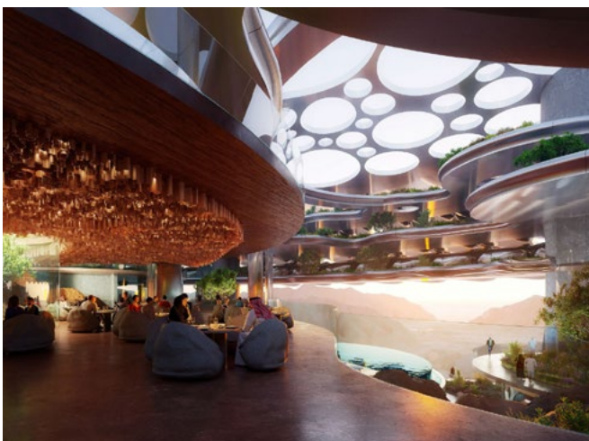
Trojena, NEOM (render)

For more information contact: f.begaj@mondiale.co.uk