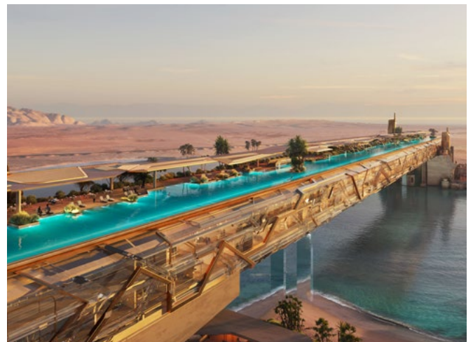
Trayam, NEOM (render)