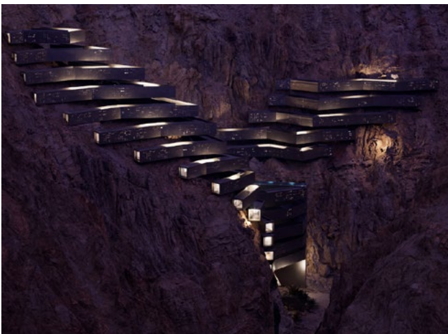
Leyja, NEOM (render)